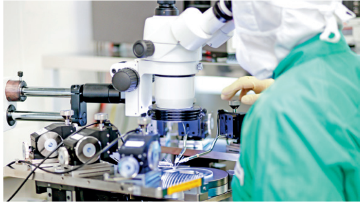
On-wafer chip characterization at Fraunhofer HHI