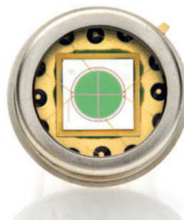
High speed, high sensitivity silicon avalanche photodiodes (APD)

Photonics for communication and sensors is one of the six focal areas in the Photonics cluster in Berlin-Brandenburg, one of the world's leading sector locations. The powerful scientific basis and the large number of specialized small and medium-sized companies with a wide range of know-how create the ideal conditions for mutual transfer between science and industry. At the same time, it drives innovation in other sectors. This is reflected in a very dynamic growth profile. The yearly growth rate averages 8% and the share of exports is 86%.